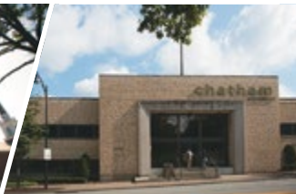
Shadyside Campus: Chatham Eastside