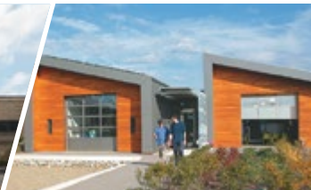
Eden Hall Campus