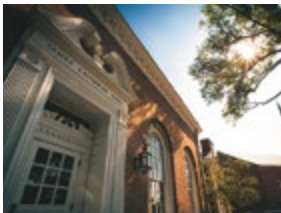
Shadyside Campus: Woodland Road